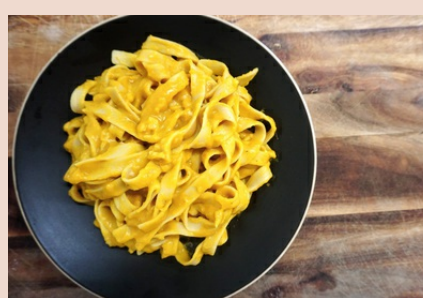
Creamy Pumpkin & Sage Pasta