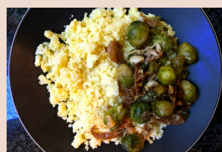
Brussels Sprouts and Polenta