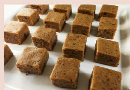
So Easy Peanut Butter Fudge (Vegan)