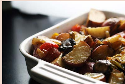
Roasted Carrots, Potatoes and Shallots