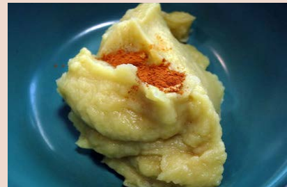
Boniatillo (White Sweet Potato Pudding)