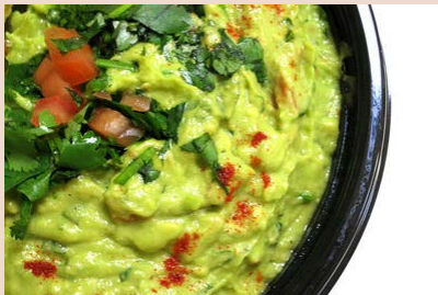
City Market Guacamole